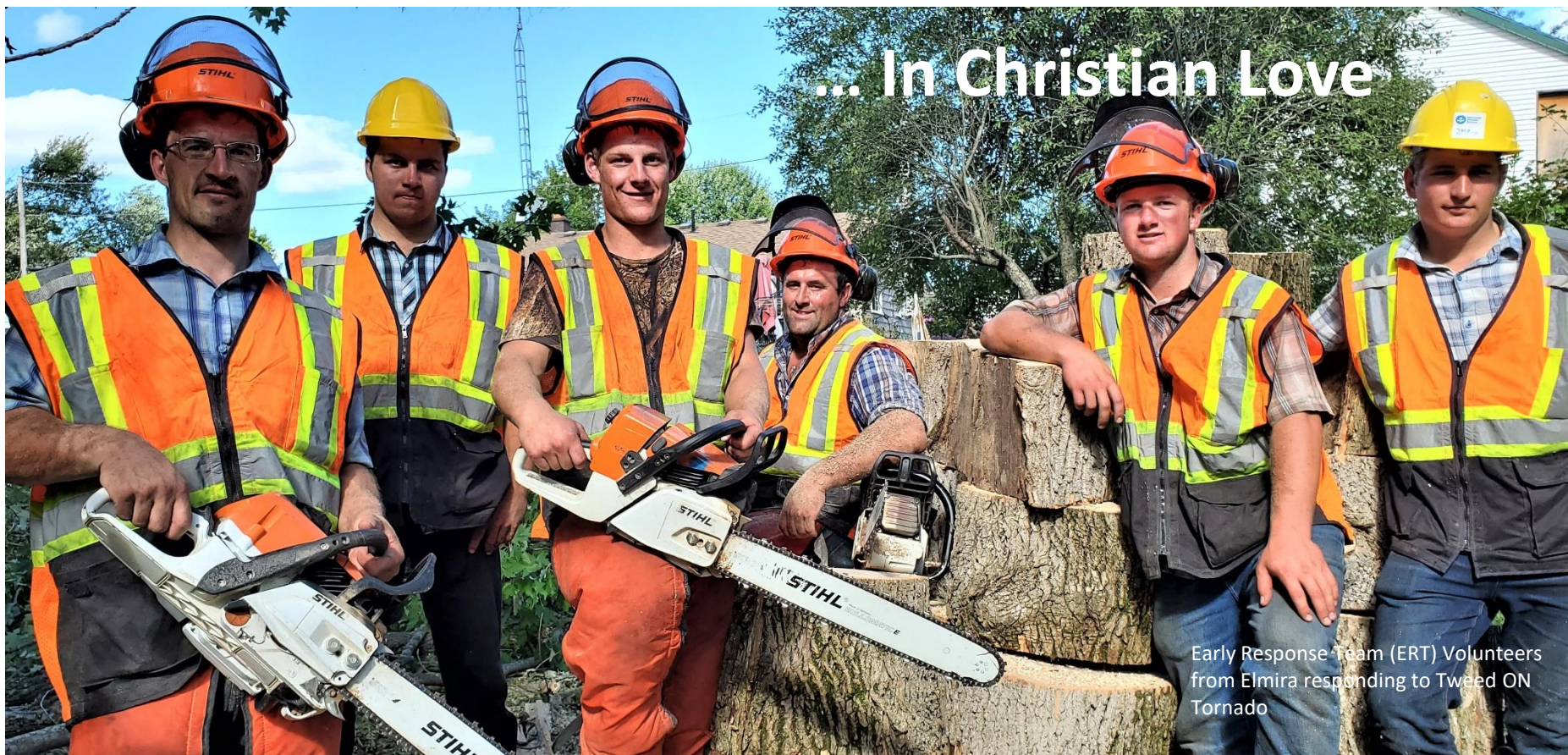
Early Response Team (ERT) Volunteers from Elmira responding to Tweed ON Tornado