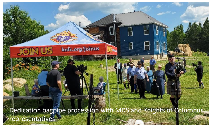
Dedication bagpipe procession with MDS and Knights of Columbus representatives