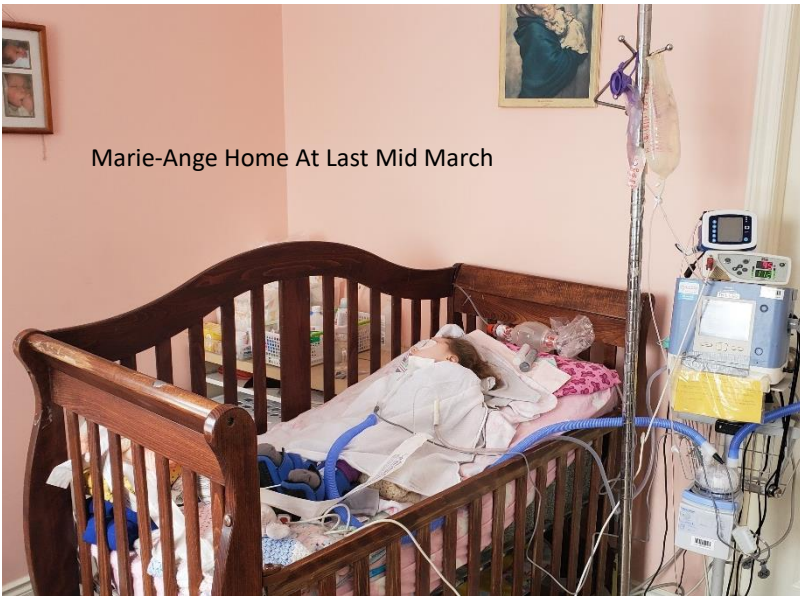
Marie-Ange Home At Last Mid March

After a 4 week break over the holidays, the windows arrived and were installed, allowing the exterior siding to be completed. Mechanical, plumbing & electrical rough-ins were done in the latter part of January in time for a crew of KoC volunteers to install the wall insulation on 29 Jan.