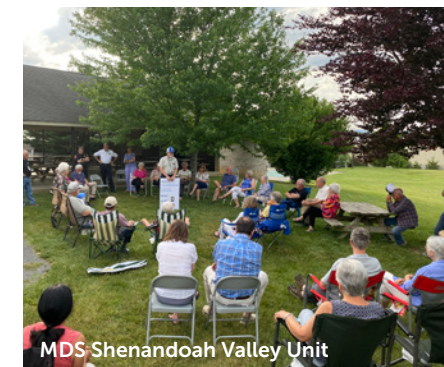
MDS Shenandoah Valley Unit

Dozens of MDS volunteers in Harrisonburg, Virginia, gathered for a picnic in May to mark how more than 250 volunteers in the Shenandoah Valley had creatively and safely reached out to help their community