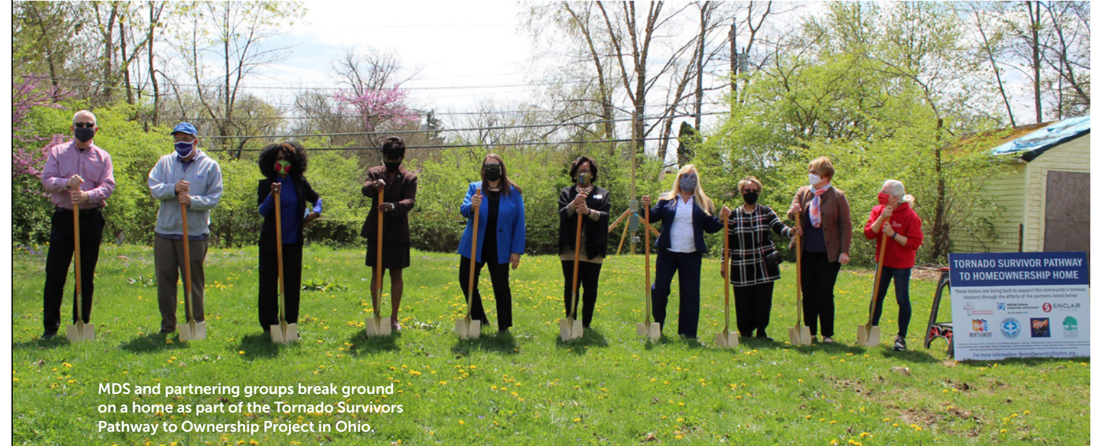
MDS and partnering groups break ground on a home as part of the Tornado Survivors Pathway to Ownership Project in Ohio.