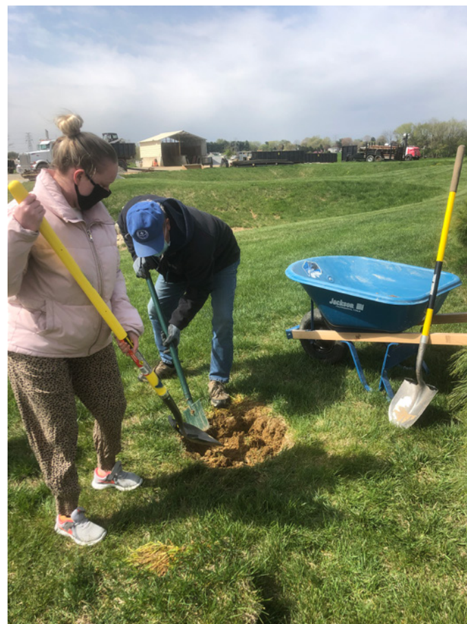
On Earth Day, MDS staff planted trees on the grounds of the MDS offices in Lititz, Pa.