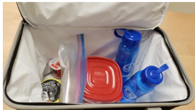
Reusable lunch bags and water bottles being used at MDS projects.

Whether planting trees at a disaster recovery site, or finding more environmentally-friendly lunch bags for use at MDS projects, MDS is caring for our planet. MDS considers the impact to the environment in every aspect of a project, from choosing environmentally friendly building materials whenever possible, setting up recycling areas for volunteers, and helping volunteers leave an area cleaner than when they arrived. ■