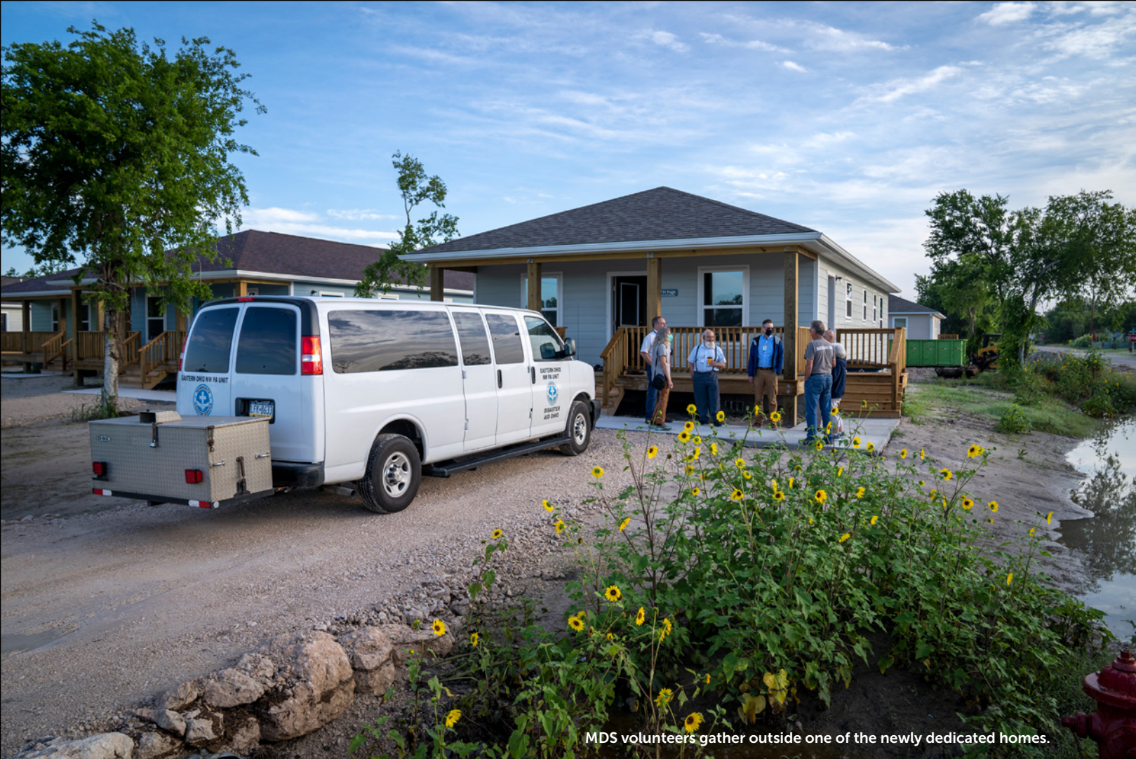
MDS volunteers gather outside one of the newly dedicated homes.