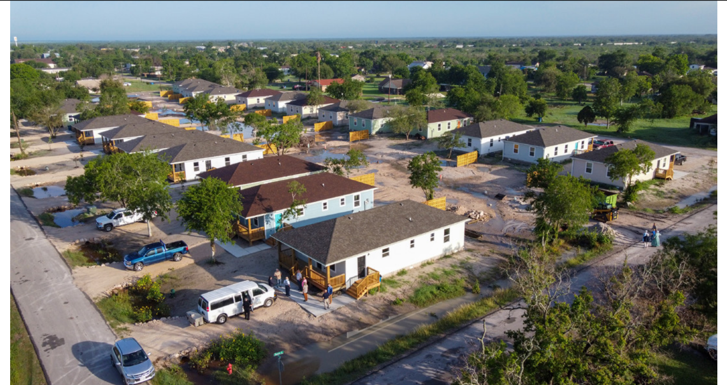
Families move into a new 23-home community in Woodsboro, Texas.